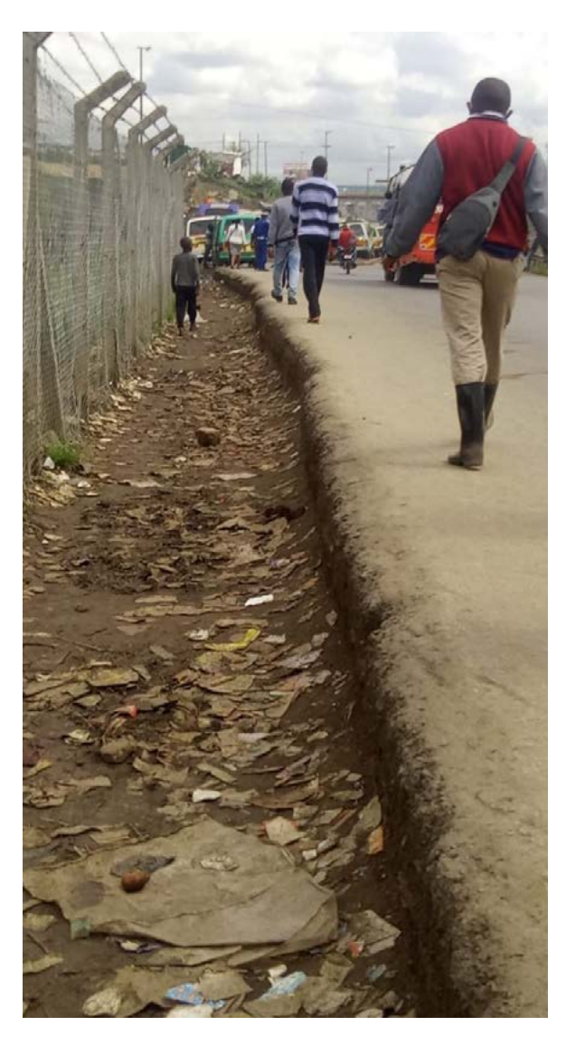
Figure 3: A potential candidate for improvement in Kenya. High pedestrian flows use this route to access the railway station.

Priority areas should include both origins and destinations frequented by disabled travellers, so as to ensure a fully accessible travel chain is provided from door to door. It is also important to consider the journeys that disabled people may need or want to make but