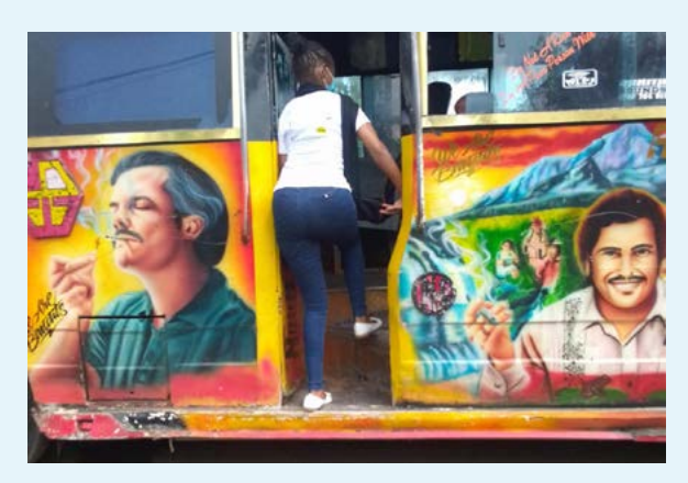
Image above: A bus with a narrow access with steps in Kenya. Without an alternative access via a lift, this would be inaccessible to those with mobility impairments.

parallel, campaigning for a more inclusive society. Among these private efforts, I have had to hire a driver/assistant who provides me with the support needed for transportation purposes. It is not an uncommon sight in Port-au-Prince to