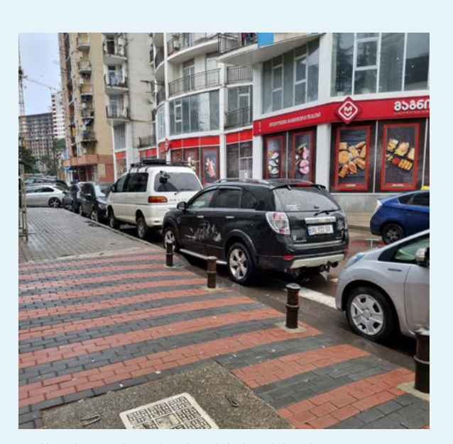
Bollards and parked vehicles block a pedestrian crossing in Batumi, Georgia.

Sometimes, poor perceptions of people with disabilities are combined with physical barriers that combine to make it particularly challenging for people with disabilities: "The hardest obstacle for my independence has been the attitude of the people. They think that we can't do many things. Also, the steps and architectural barriers. I had an experience in the Casa de la Cultura with the director. There were many steps and I couldn't enter so I sent someone to call for help and when the