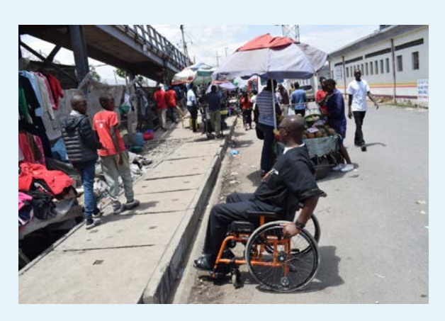
Image above: A footway at a different height to the street, with no ramp prevents the man in a wheelchair from joining the footway in Kenya.

As many environments are often inaccessible for people with disabilities, there are often practical mitigations put in place by individuals to allow them to access the locations and services they need: "I have been forced to come up with practical solutions to face headon with confidence an ill-equipped environment to live an active life with Muscular Dystrophy while, in